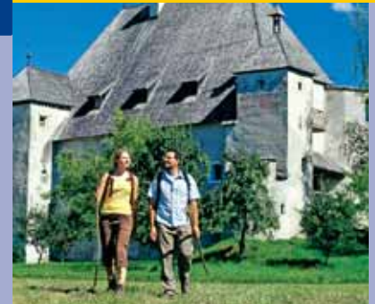
Sonnenburg in St. Lorenzen