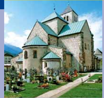
Abbey Church in Innichen

Welsberg is the birthplace of Paul Troger, creator of the famous frescoes in Brixen Cathedral, and the three altarpieces in the parish church of his home village are also his work. The frescoes of the little Gothic shrine behind the church are, however, painted by the second great artist of the Puster Valley, Michael Pacher.