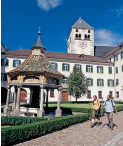
Convent of the Augustinian monks of Neustift

along the trail 4 down and to the right, we finally arrive at Neustift in little more than an hour. Neustift Abbey, with its famous Gothic cloister and Baroque Hospital Church, was founded in 1142 by the beatified Bishop Hartmann and was converted into a military stronghold in the 16th century from fear of the Turks. Here we can admire the early and late Gothic frescoes both in the cloisters – where incidentally the medieval Tyrolean troubadour Oswald von Wolkenstein is buried – and in the Romanesque Chapel of St. Victor, whilst the circular Romanesque Chapel of St. Michael, also called “Engelsburg” or “Angel Castle”, built outside the abbey walls, is still a bit of a mystery. The shape of the Romanesque Engelsburg, and the fact that it is situated outside, suggests that it was built as accommodation for pilgrims. Since we are already in Neustift, we really must visit the medieval Cathedral city