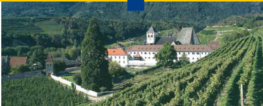
Convent of the Augustinian monks of Neustift

When travelling, walking and making a pilgrimage, an existential human phenomenon is expressed. There is fundamental evidence, most especially in the message of the Bible, in the Old