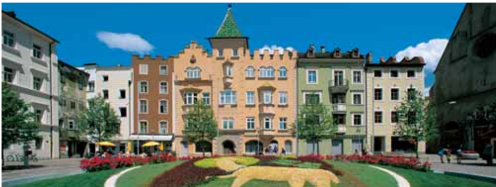
Cathedral square of Brixen with the City Hall

old bridge, turn to the right and travel along Trail 1 crossing over the main road and under the motorway, until we reach Lake Vahrn. Going around the lake’s eastern bank we come to a cycle path parallel to the motorway and take that to Franzensfeste. This place was named after the gigantic fortress, built between 1833 and 1839 by the Emperor Franz I of Austria, but which was never used for warlike purposes.