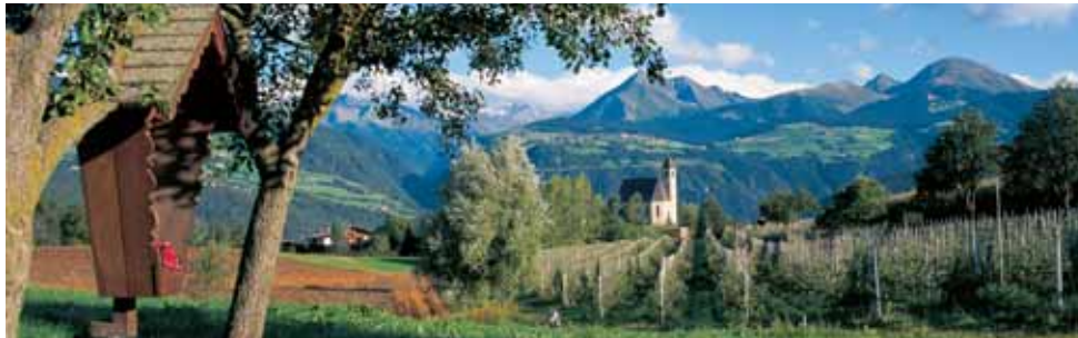
Natz-Schabs apple plateau: Church of St. Magdalena in Viums

patronage – with its beautiful frescoes both external and internal, and the late Gothic cemetery Chapel of St. Florian, form a unique group, so beautiful it is difficult to leave it behind. If you head for the Brenner on the direct route, not visiting Neustift (and Brixen), you should carry on from the 5th Station along the Way of the Cross, which ends just before Aicha at the pilgrimage chapel in the pine forest. The “Stöcklvater” Chapel (18th century), a local place of pilgrimage especially during Sundays in Lent, gives us a chance