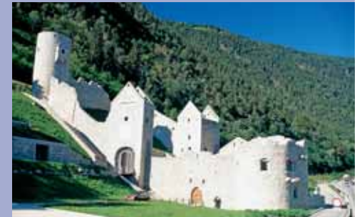
Fortress Mühlbacher Klause

to stop for a while. Going through Aicha (late Gothic Church of St. Nicholas) and along another track by the Franzensfeste reservoir and into the town, we come to a railway junction, important since the end of the 19th century. If you want to visit Neustift and Brixen – and there are many good reasons for doing so – stop at the 5th Station, turn left down the mountain, and cross the bridge over the Puster Valley main road towards Schabs. Continuing along Hiking trail 8, then straight along the little road and from the Gasthof Strasser