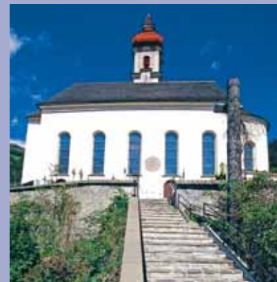
Church of Gossensass

along the railway tracks or (from Brennerbad) on the existing cycle path. Shortly before Brenner a small track branches off to the right, which leads us to a mystical modern installation (“84 Steps”). This small “observation bunker” from the Second World War has a view out over the area. The Brenner is not only one of the busiest of the Alpine passes, but it is also Europe’s border of fate and destiny with a colourful past. It is a magical place radiating an austere romanticism. We line up, one of millions – pilgrims, merchants, soldiers, popes, kings, emperors and sun loving tourists – who have crossed this lowest Alpine pass over thousands of years. The late Gothic parish church (14th century, the choir is also from this time), dedicated to St. Valentine, a missionary bishop from early Christian Rhaetia, and patron of paths and health, is exactly the right place for us to bid farewell to this wonderful stretch of the Way of St. James through South Tyrol.