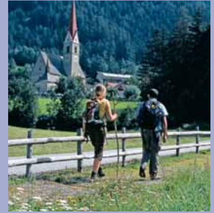
Maria Trens at Freienfeld

time, because the old road above Sterzing passed through Thuins. However the pilgrims' hospital of St. John of Jerusalem and the Teutonic Order of Knights were to be found in Sterzing, as were frescoes depicting the pilgrims' apostle painted on the outer walls of private houses (one on the Geizkoflerstraße, the other on the main road in the direction of Gossensaß). The "Deutschhaus" (the living quarters of the Knights) very close to the parish church, which is well worth seeing (the first pillar on the left was donated by the brotherhood of St. James) and the „Johannisstüberl" in the old part of the town (in the former hospital chapel) are still a reminder today of the two military Orders of Knights so important to pilgrimage routes throughout Europe. In the town's coat of arms our eyes can't fail to see the "Sterzl" shrouded in legend. Perhaps it is this devout pilgrim with rosary, and supported on crutches, who has lent his name to this historic town.