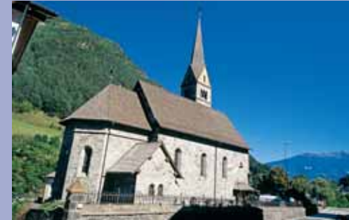
Church of Franzensfeste