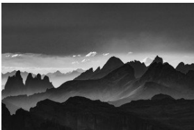
PHOTO EXHIBITION VAL BADIA - DOLOMITES UNESCO WORLD HERITAGE

To celebrate the first 10 years of DOLOMITES UNESCO, an outdoor photo Exhibition dedicated to the DOLOMITES of Val Badia, will be set up in San Vigilio. The inauguration of the 'Val Badia - Dolomites UNESCO world heritage' exhibition will be held on June 27th. The 32 large format photos were provided by Foto Club Val Badia.