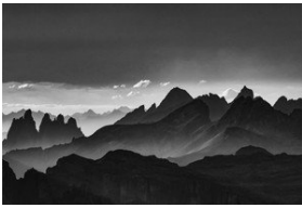
PHOTO EXHIBITION VAL BADIA - DOLOMITES UNESCO WORLD HERITAGE

To celebrate the first 10 years of DOLOMITES UNESCO, an outdoor photo Exhibition dedicated to the DOLOMITES of Val Badia, will be set up in San Vigilio. The inauguration of the 'Val Badia - Dolomites UNESCO world heritage' exhibition will be held on June 27th. The 32 large format photos were provided by Foto Club Val Badia.